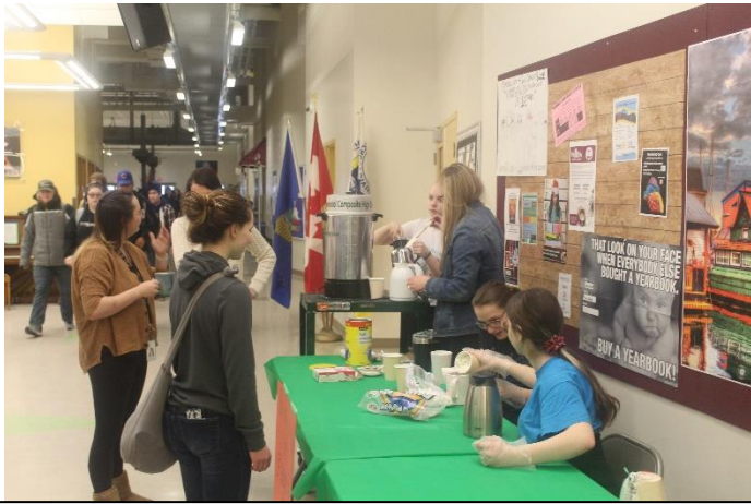
Bring Your Own Mug Day