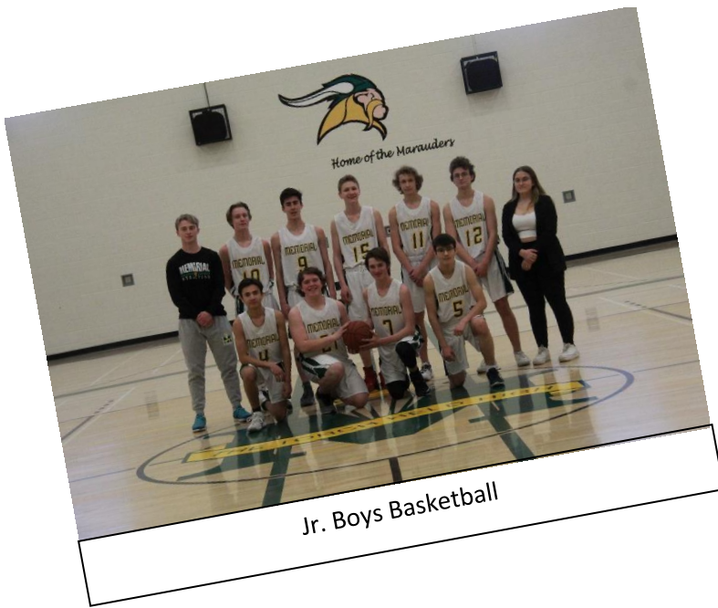
Jr. Boys Basketball