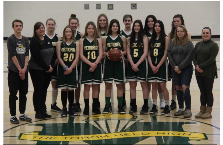
Jr. Girls Basketball