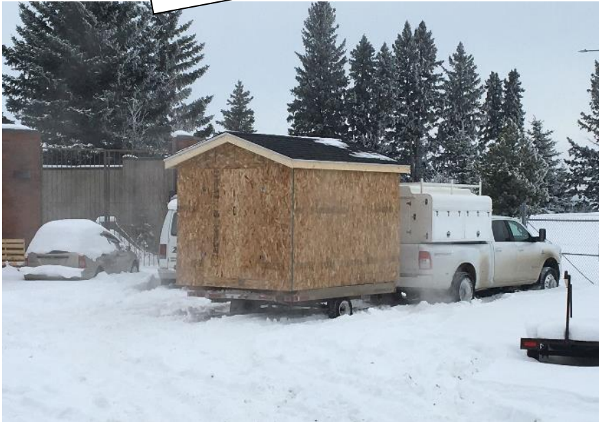
ANOTHER HAPPY CUSTOMER!