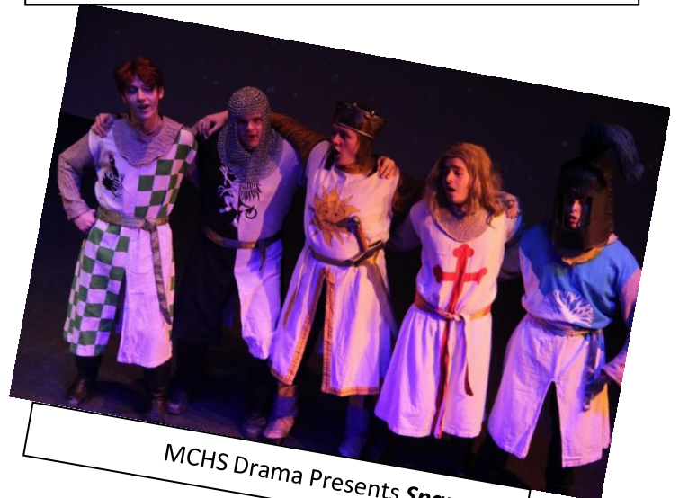
MCHS Drama Presents Spamalot