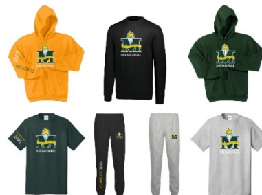
Visit the Memorial school website or Green and Gold Athletics website for the online store links