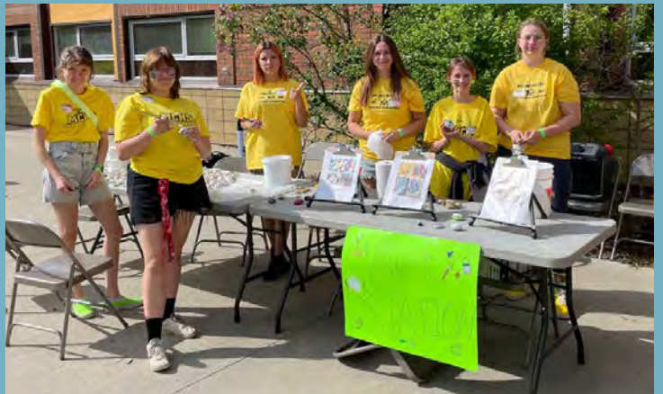
Unified Games Art Station volunteers