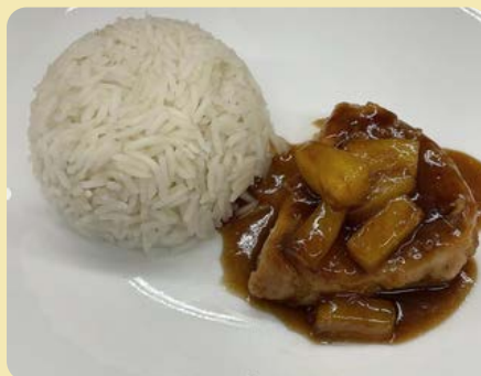
Sweet and Sour Pineapple Pork Loin with Rice