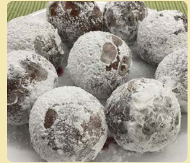
Doughnut Day- Traditional, jelly and Italian