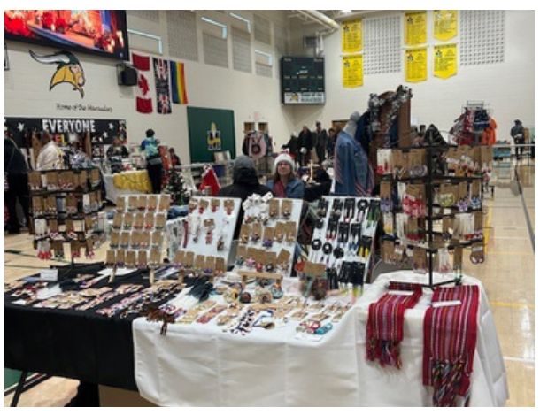
Life @ Memorial